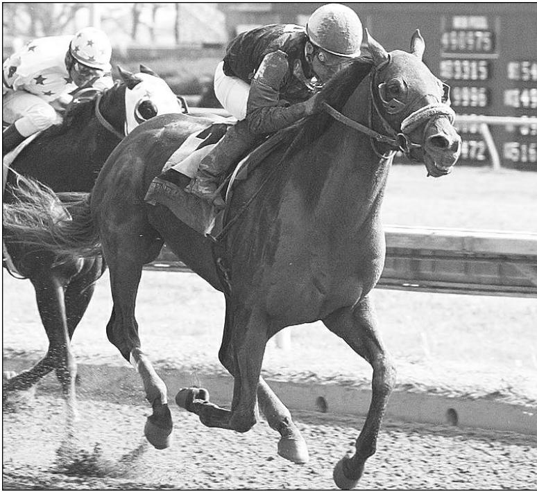
Sun King, shown winning the Commonwealth BC, worked on Saturday.